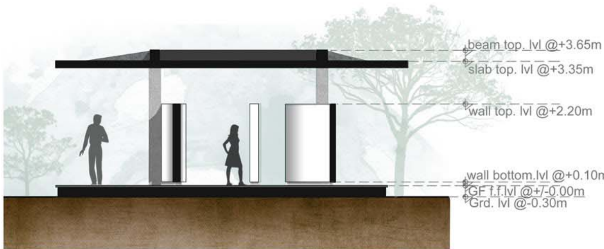
SECTION - BB