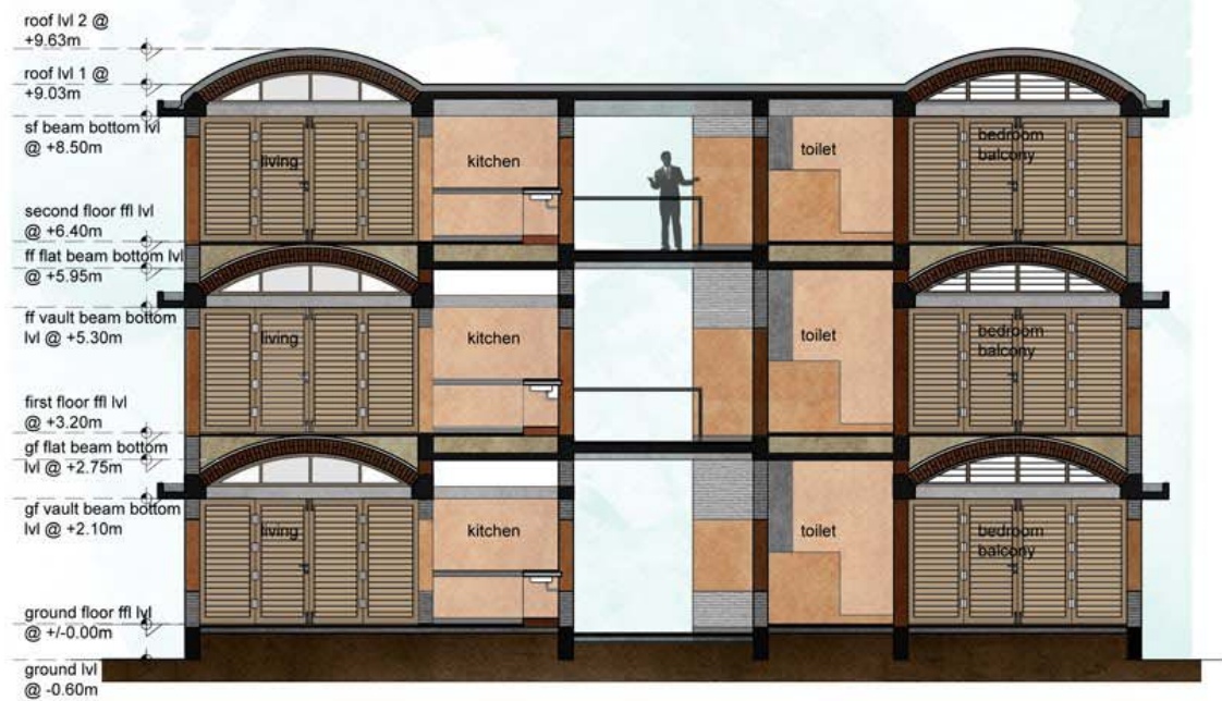
TYPICAL SECTION EE OF APT - A&B