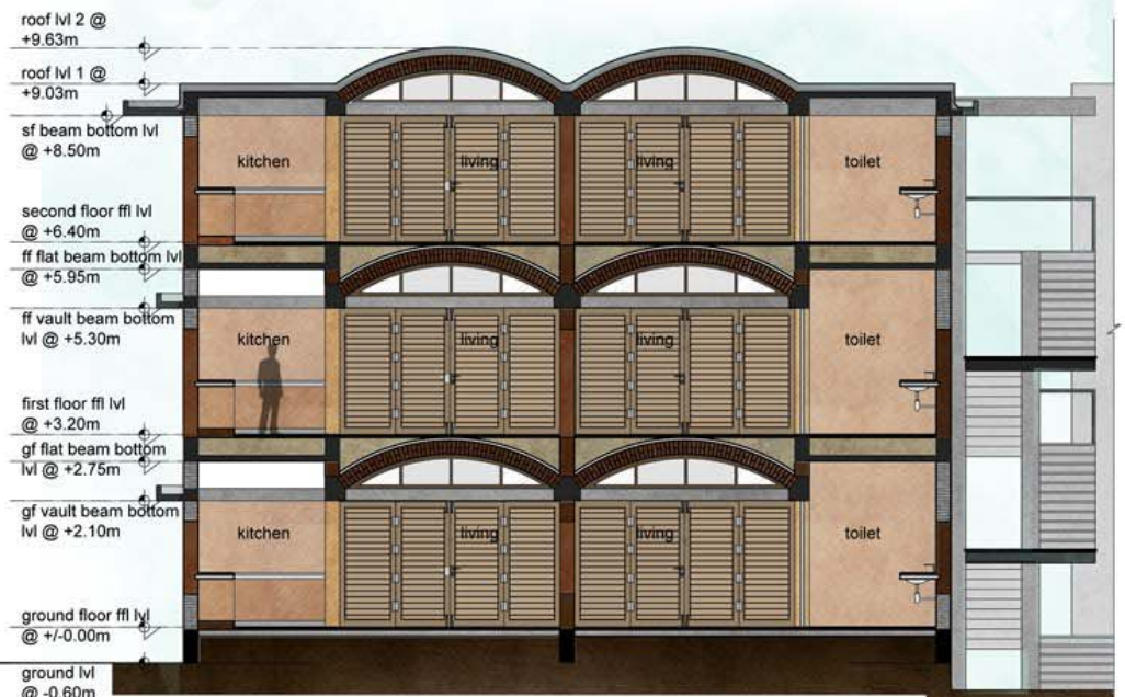
TYPICAL SECTION FF OF APT - A&B